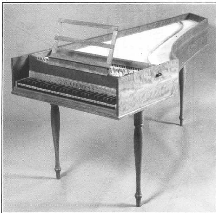
The new French Single Harpsichord, with optional second 8' choir, buff stop and music desk.